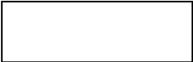
IFTT 8 71" x 29.5"